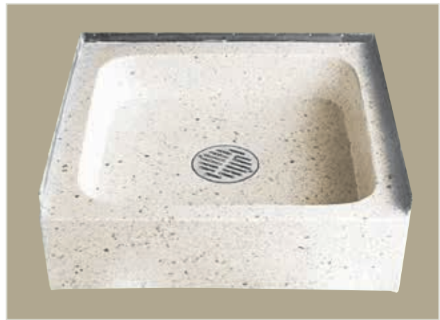
Shown: Model 40

2851 Falcon Drive • Madera, CA 93637 T. 559.661.4171 • T. 800.446.8827 F. 559.661.2070 • florestone.com