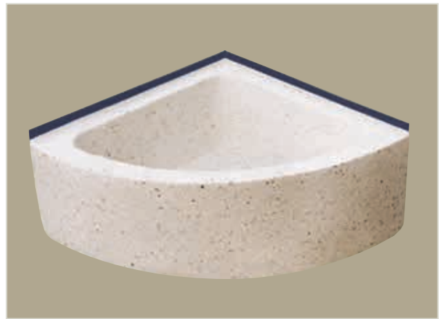
Shown: Model 97