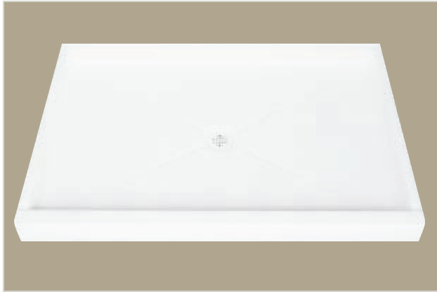
One piece, single threshold model for recessed installation. Features 1" flange on three remaining sides. Center drain.