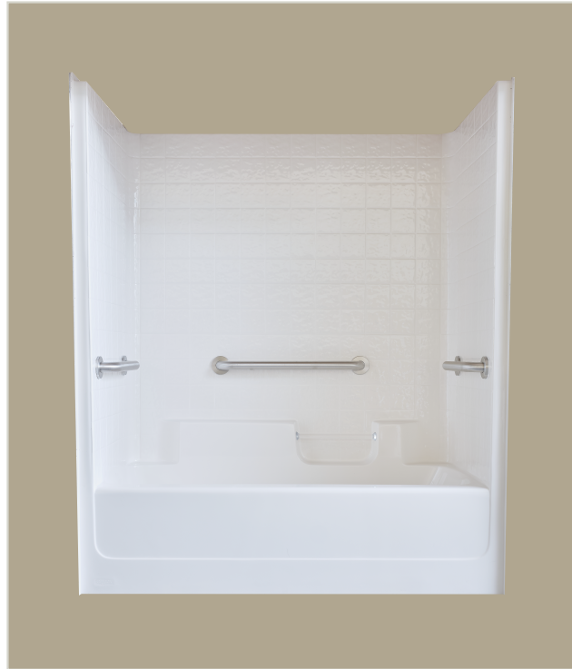
Above photo shown is a LH drain with optional grab-bar installation.

2851 Falcon Drive • Madera, CA 93637 T. 559.661.4171 • T. 800.446.8827 F. 559.661.2070 • florestone.com